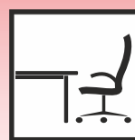
For application in general areas