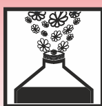
For general air improvement